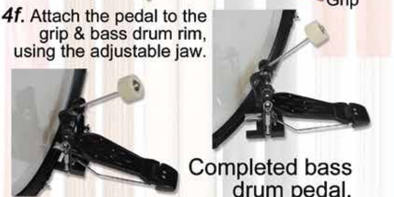
Completed bass drum pedal.