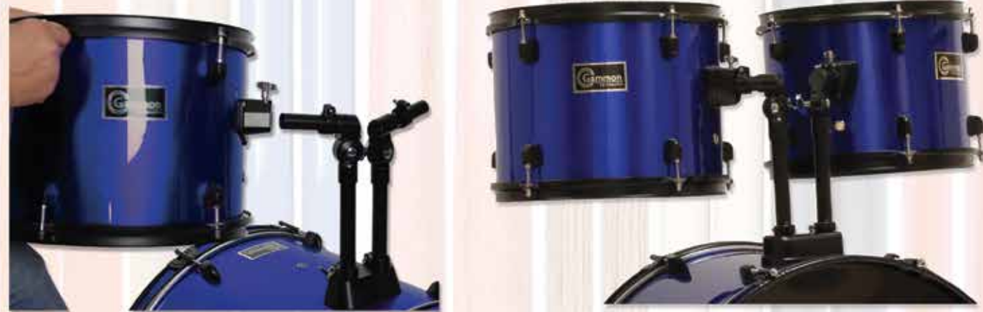
Completed Mounted Toms

6d. Insert the mount on the tom into the top of the arm & tighten the wing nut. Repeat for other tom.