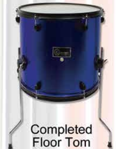
Completed Floor Tom

WARNING: CHOKING HAZARD Not for children under 3 years.