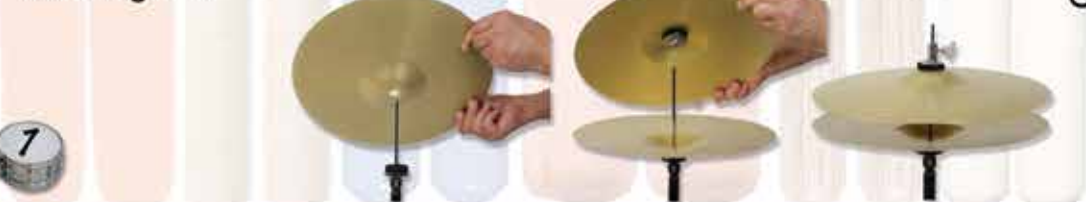
Completed Hi-Hat & Stand

8g. Place the other cymbal - domed side down - over the rod, then place the first hi-hat cymbal - domed side up - over the rod & tighten the wing nut.