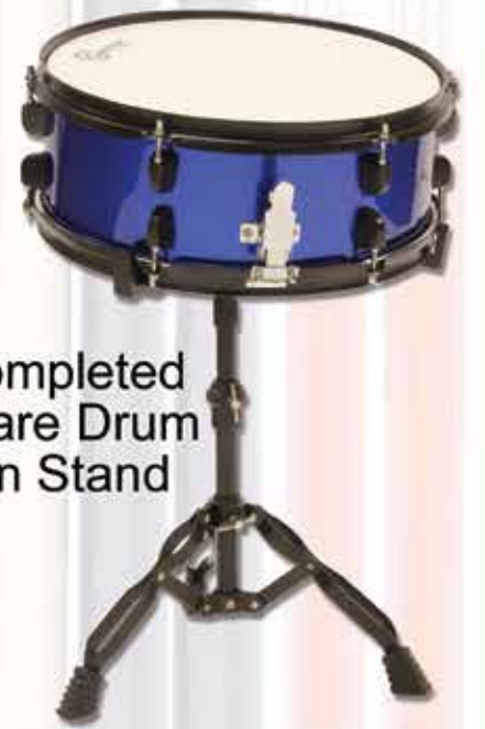
Completed Snare Drum On Stand

WARNING: CHOKING HAZARD Not for children under 3 years.